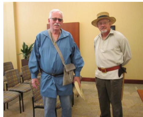
Recognize these pioneer settlers?