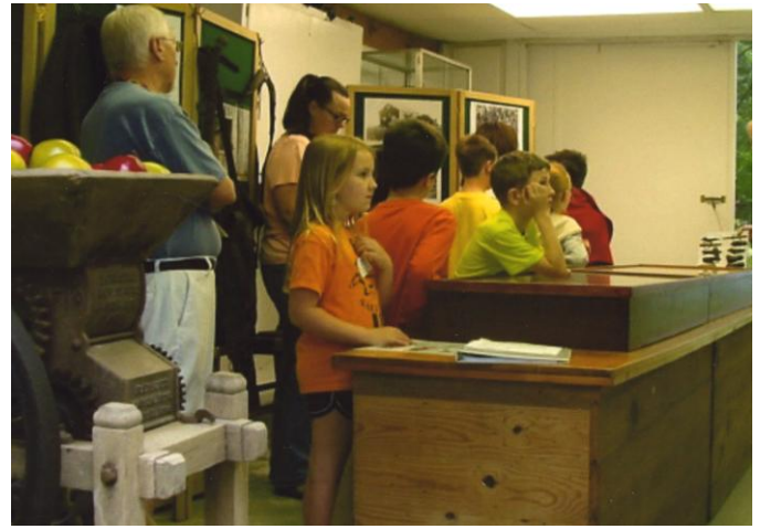
Students in the Annex looking at the farming and tools displays.