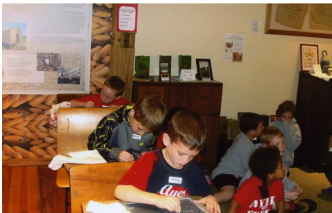
Second graders in the History Room, sitting at vintage school desks and writing on the slateboards.