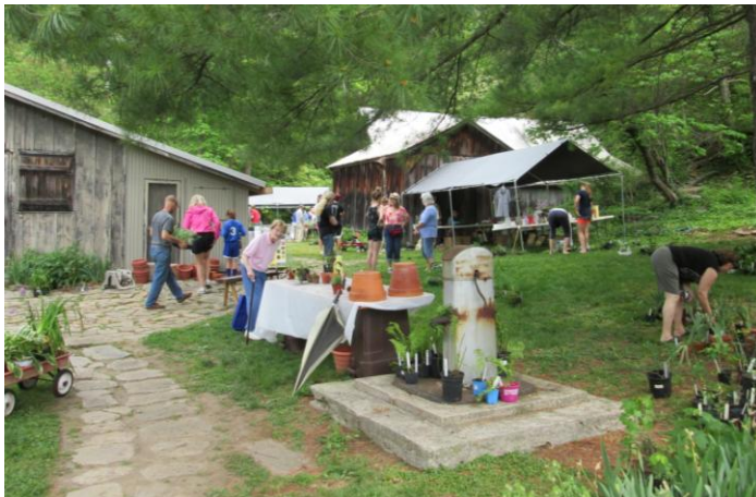
Plant sale spread out around the Log House at mid-day May 16, 2015.

Open Houses - The Open House season at the Log House started on Sunday June 7, 2015. So far, attendance has been less than hoped for. As mentioned in the last Surveyor and at our monthly meetings, the Log House and Annex have new, improved displays and lighting. I hope you will make time this summer to check out the new look and possibly sign-up to work a shift or two on a Sunday.