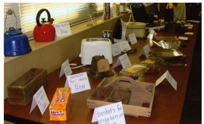
Then and Now display set up by ATHS volunteers at the History to Schools program at Anderson Center.

"I am so thankful learning how the olden days worked. Man, it shows hard living in the past."