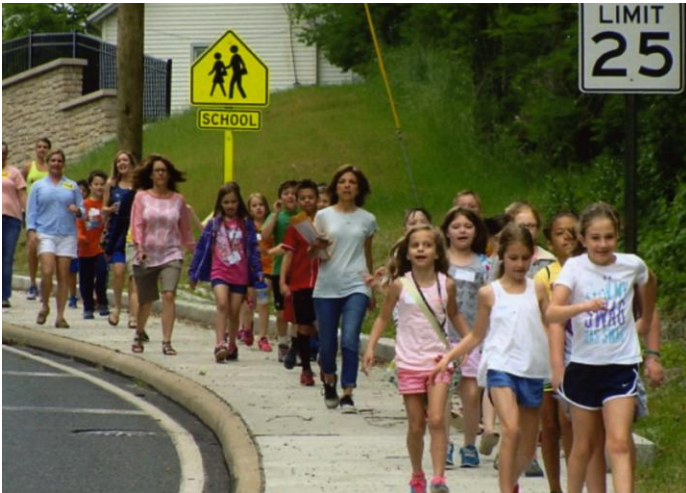
Mercer Elementary School third-graders walking down to the Log House on the new sidewalk along Bartels Road.