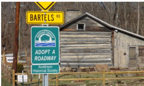
Adopt a-Roadway sign on Clough Pike near the Log House.