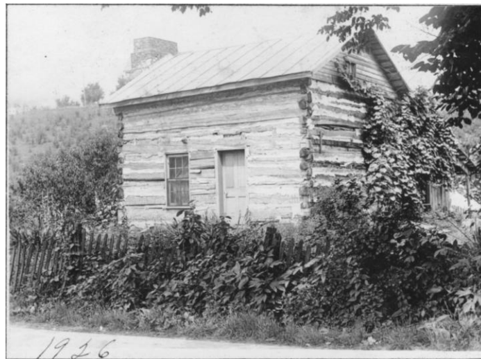
Vintage view of the Miller-Leuser Log House, dated 1926. Notice open hillside to the west of the house, the metal roof and the open porch at the back of the house. The porch was enclosed in about 1930.

If you would like to receive e-mail reminders for all the monthly meetings, send an e-mail to athslighthouse@yahoo.com and we will add your e-mail address to the ATHS e-mail list.