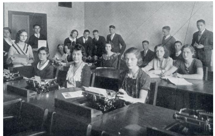
Photo on display at the History Room from the Anderson High School Yearbook of 1932: members of the school newspaper “The Lantern” posed in the typing class room. The centralized school for Anderson opened at Beechmont and Forest in the fall of 1929 and for the first time high school classes were offered. Courses included training in modern office practices.