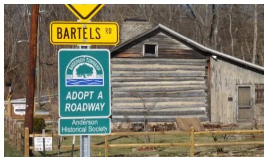
Adopt a Roadway sign on Clough Pike near the Log House.