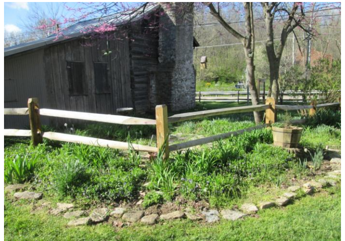
Memory Garden on the west side of the Log House in early spring. April 2, 2016. The Redbud tree was just beginning to show bright pink blossoms.