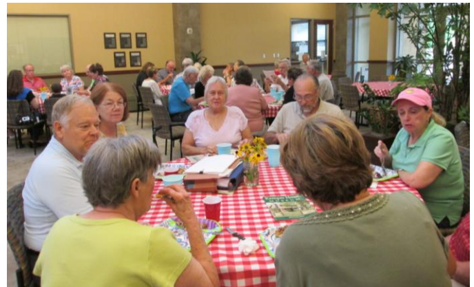
Annual Picnic, August 2015.

Join us as we continue the long tradition of the summer picnic. We will again enjoy the comforts and air-conditioning of Anderson Center for the event. Tables and chairs will be set up in the Lower Atrium. You can walk outside before dinner and enjoy the nature trail around the ponds if you like.