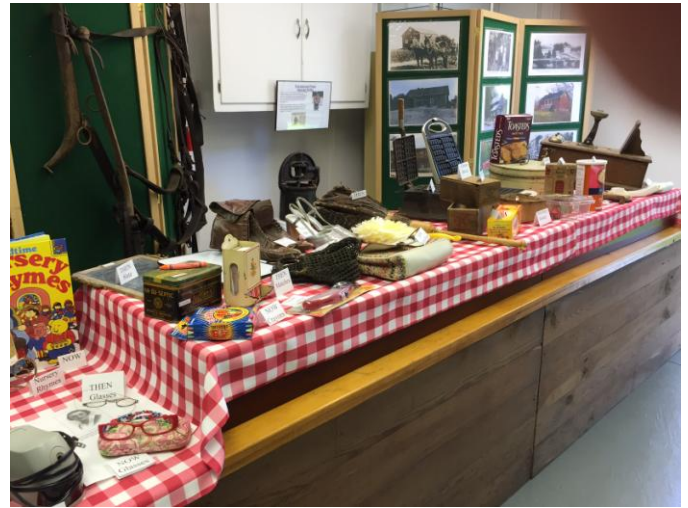
“Then and Now” items are on display in the Annex, along with the farming heritage display of images and artifacts.