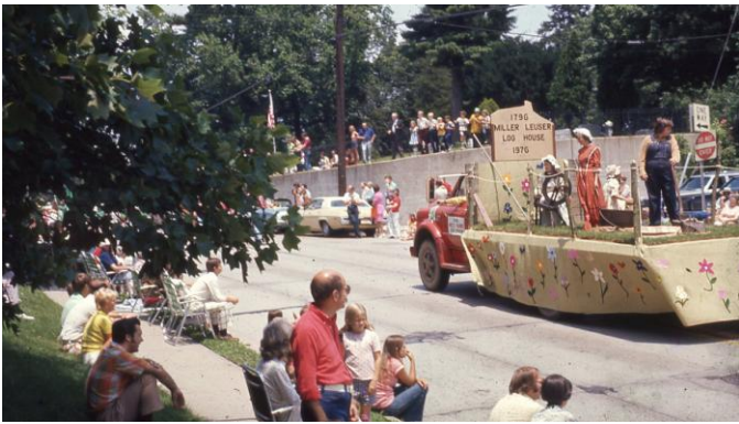
ATHS float at the local U.S. Bicentennial Parade in Mt. Washington, July 4, 1976.