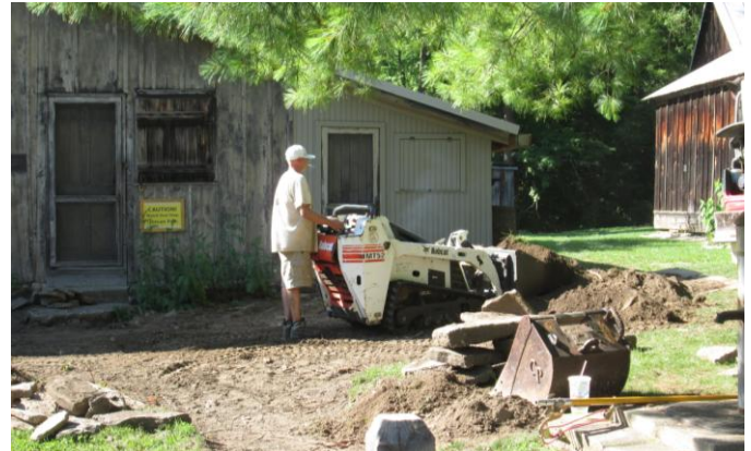
On Monday, stones were picked up. Excavation work to install a deep compacted base was begun.

During the week of July 11-15, 2016 the David Vogel Landscape Company worked on rebuilding the pathway from the parking lot to the east side doors of the Log House and around the southeast corner of the house to the front door. Here are a few images of the work.