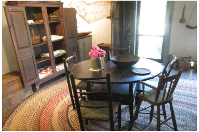
Log House, front room, the earliest part of the house. June 5, 2016.

The Log House displays were updated over the winter, presenting a new look to the building. I hope you will make time this summer to check out the new look and possibly sign-up to work a shift or two at the Log House or History Room.