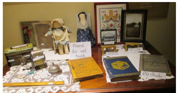
Display set up by ATHS volunteers in the History Room for the History to Schools program at Anderson Center this spring.