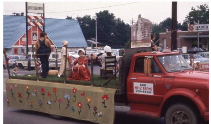
ATHS float at the Bicentennial Parade in Anderson Township along Beechmont, July 3, 1976.

artifacts were displayed on the float. Several youngsters in appropriate costumes rode on the float. ATHS members, also in appropriate garb, marched alongside the float.