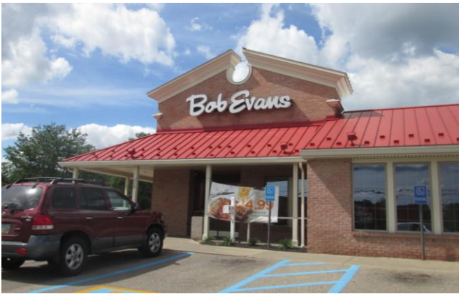
Fund raiser on Tuesday, August 9, 2016 at Bob Evans, 510 Ohio Pike.