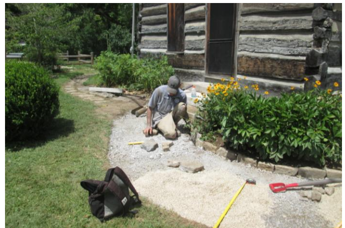
By Friday, the base layer was in place and compacted. Workers carefully pounded stones in place at the edge of the soil near the Log House. Step stones at the front door were installed. Come visit, see the results and test out the new pathway.