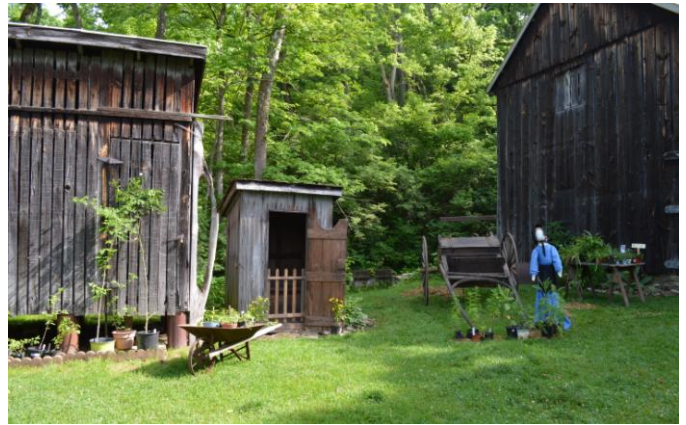
During the Garden Tour, plants for sale left from the May Plant Sale were attractively arranged in the area of the corn crib, outhouse and barn.

Please come visit our gardens and notice the marvelous plant labels that have been installed. Stop by the Memory Garden, look at the plants and enjoy the garden benches. Admire the 15 stars and 15 stripes U. S. Flag, a replica of the official U. S. flag from 1794 to 1818. There are great memories