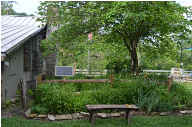
Memory Garden at the Log House. June 5, 2016.