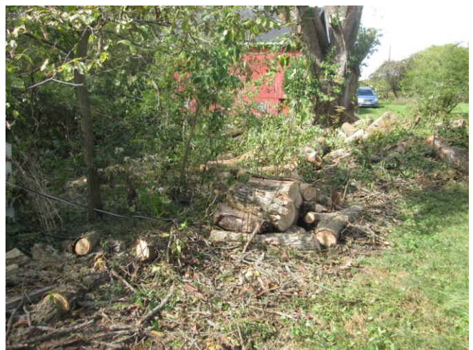
Some large dead trees on the Bartels Road property were cut down and trimmed into pieces by Vogel Landscape Co.