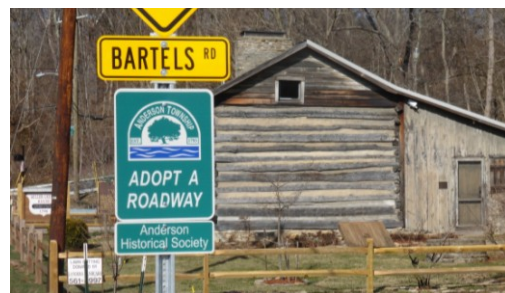
Adopt a-Roadway sign on Clough Pike near the Log House.