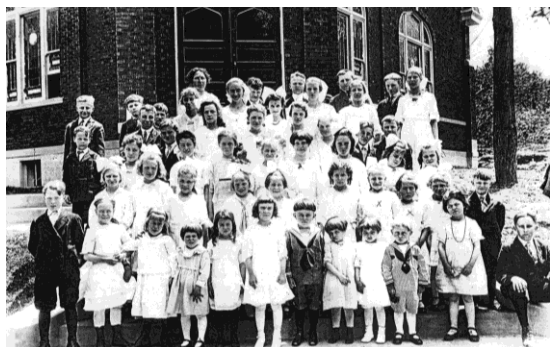
Clough United Brethren Church Sunday School, May 8, 1921.

The materials include family sheets and documents such as letters; photographs; newspaper clippings; cemetery records; and items from churches, schools, social organizations and businesses. The papers are organized and stored in labeled archival file folders within archival document cases, supported by internal case dividers. Original documents, fragile items and photographs were