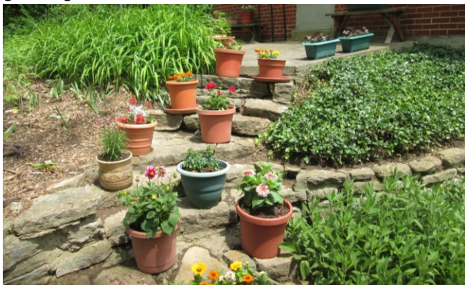
Potted plants on rock steps, June 2016.

ATHS Gardens Update. We have recruited a team of volunteer gardeners who will be responsible for maintaining one garden area. They will find other volunteers to help them. We are in need of a few more volunteers to select a garden area. By having this system of individuals responsible for specific garden areas, it is hoped that garden care will be easier for all and better for each garden area. This year the ATHS Log House area has been adopted by the Hamilton County Master Gardener group and its members will be helping us throughout the growing season.