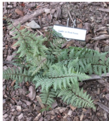
Lady in Red Fern and pink Phlox, Mullein, and a variety of ferns. Please come to see our property and the gardens.

We have developed a herb garden near the side door of the Log House. In pioneer days, herbs were planted by the kitchen door so they were close to the kitchen for use in cooking. Also when the women walked by, their long skirts would brush the plants, giving off pleasant scents. There are different displays and plants to be seen throughout the seasons.