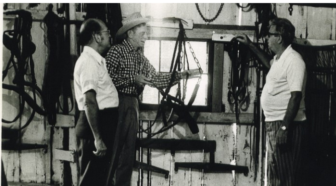
Vintage view of the Clough Pike barn from the 1970s. Notice the display of harness and tools mounted on the wall.