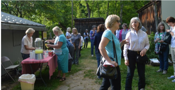
Master Gardeners at Log House, June 6, 2017.