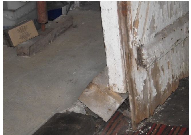
Showing the sill on the east side of the barn; in the upper left, notice the base of the steel column installed in the past to stabilize the east side.

very conceivable that the entire side of the barn would have collapsed. A couple of steel columns and a 4x4 were used to stabilize the side of the building. The base of the steel column can be seen in the upper left-hand corner of the photograph. While effective, the execution is less than good. The column rests on a piece of 4x4 and is not connected to the floor. In addition, a 4x4 support beam is tied to the rafters with rope. A blow to the top or bottom could cause collapse of the structure. The west side sill now shows evidence of the same thing happening as had occurred on the east side. If we want to preserve (or stabilize) the barn, we must take immediate action.