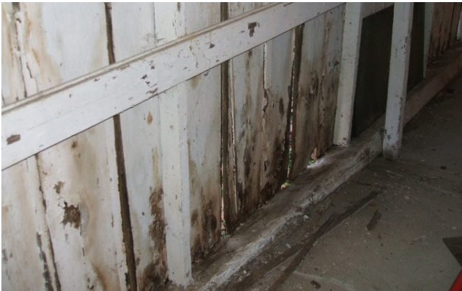
Rotting siding on the west side of the barn

Several issues have come up that will require significant effort and cost to prevent eventual loss of the barn structure. Over many years, rain water from the roof has caused significant erosion of the foundation on the west side of the barn. A gutter system and better grading between the barn and creek would have solved a lot of this problem if enacted 15 or more years ago. Unfortunately, the cost was deemed to be too high and the gutter project on the west side was dropped.