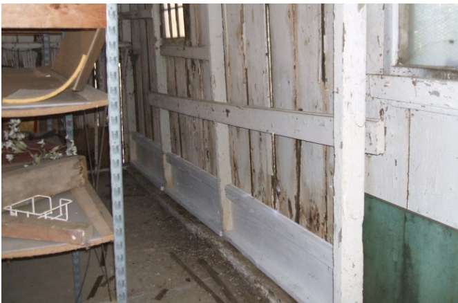
After "band-aid" repairs to the west side

The continued run-off of water has had two effects. The siding has rotted up from the bottom as much as 12" causing the siding boards to become detached from the sill boards. A band-aid has been placed on this problem. We have mounted plywood on the interior of the siding to attach the siding boards to the structure.