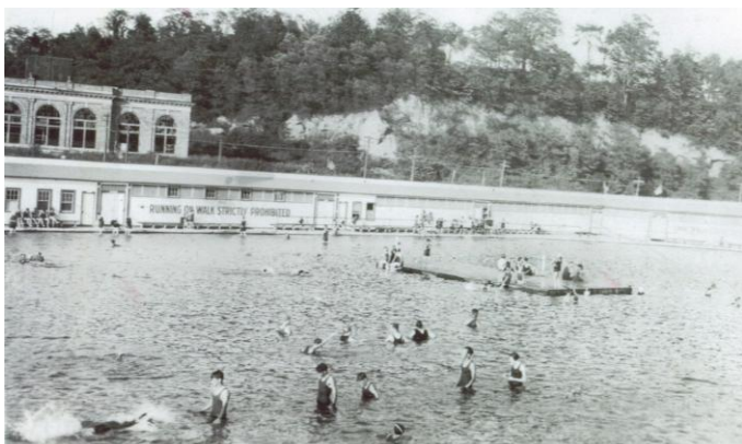
Coney Island souvenirs and images are on display at the History Room.