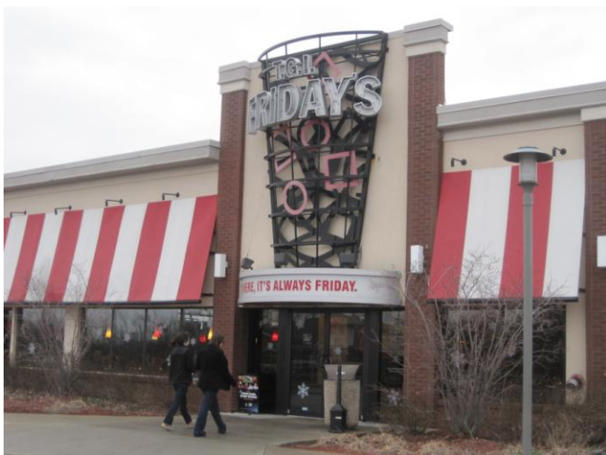
Fund raiser on Tuesday, May 21 at T.G.I. Friday's restaurant at Anderson Towne Center.

We send e-mail reminders to members for all the monthly meetings. If you would like to receive such reminders, send an e-mail to athslighthouse@yahoo.com and we will add you to the ATHS mailing list. If you wish to be removed from this list, please let us know.