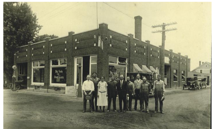
Ayer Ford dealership at 7636 Beechmont, corner of Beechmont and Wolfangel, photo about 1923.