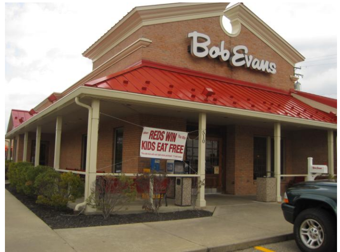
Fund raiser on Tuesday, June 18 at Bob Evans, 510 Ohio Pike.