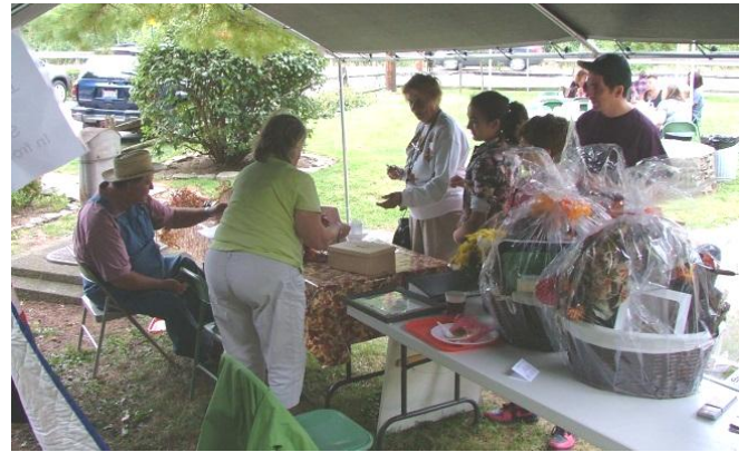
Raffle table in action.

The raffle drew lots of attention again this year. All of the prizes were won by non-members.