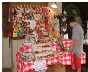
Scenes from Country Store 2013.

The many items in the Log House drew interest from young and old. Sales were brisk throughout both days.