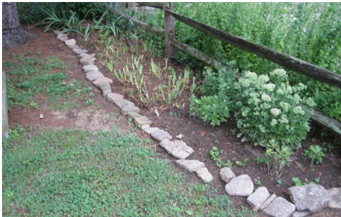
Edge near the parking lot.

The digging up and moving of the plants was hard because of the many rocks in the ground. We moved all the plants we could and placed them in other areas where they can survive and grow until better places for them can be found. The timing of the move was not ideal since many were blooming or about to bloom.