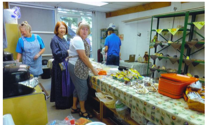
Kitchen ready for customers.