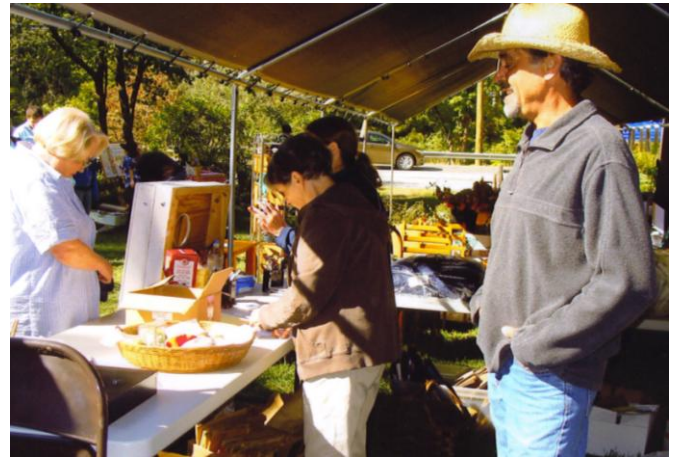
Cobweb Corner sales.