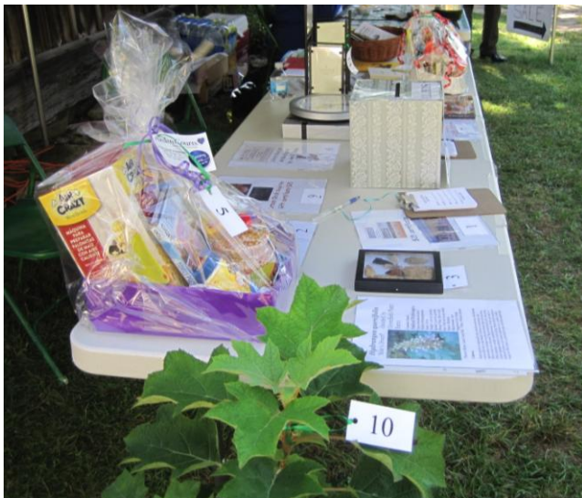
Silent Auction table.