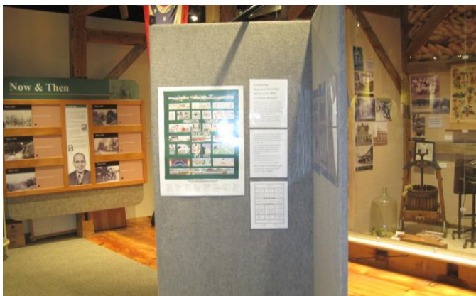
View in History Room, Anderson Center, Jan. 2014.

Come visit the History Room during its open hours: Sunday and Wednesday afternoons, 1 to 4 p.m., and Tuesday evenings, 6 to 9 p.m. Learn about the history of Anderson through photos, hands-on exhibits and artifacts. Anderson Center, 7850 Five Mile Road, Lower Level. Come see the exhibit of some materials from the celebration of Anderson Township's Bicentennial Celebration in 1993. Now's the time to start thinking about how we might commemorate the 225 th anniversary of the Township in 2018. We'll also be celebrating the 50 th anniversary of the Anderson Township Historical Society in 2018. The History Room is jointly sponsored by ATHS and Anderson Township. Volunteers from ATHS staff the History Room.