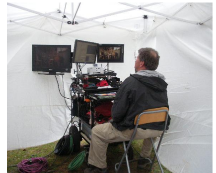
Monitoring camera images.

Thirty people including the crew, the talent, the caterers, representatives from the advertising agency and the clients from the Ohio Lottery Commission roamed around.