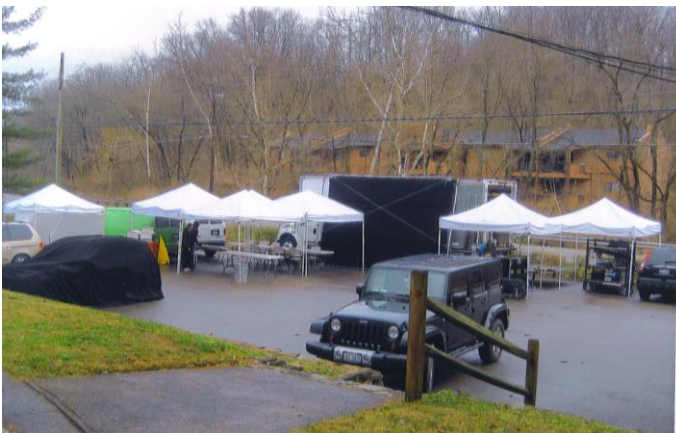
Some of the tents and tables in the parking lot.

Of course, there were small, medium and large bowls full of porridge and three chairs. Three fishing poles, three bear portraits, three lanterns, three crocks, three canisters, three banjos, three mounted fish trophies, a rustic wooden coat rack and a baby bear pull toy completed the décor.