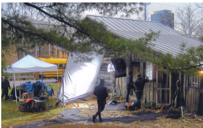
A man holding a bear paw is at the door.