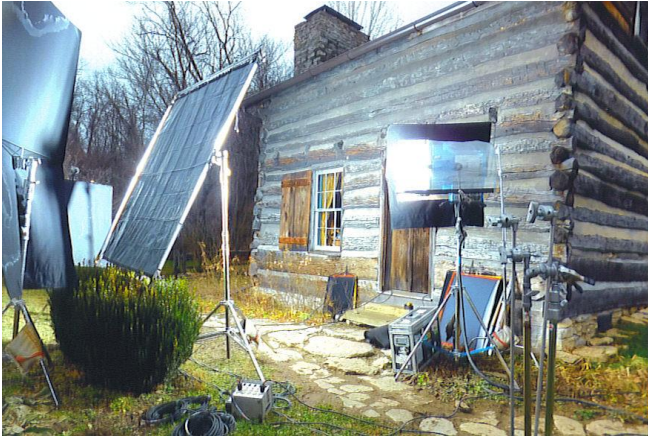
Lights and reflectors set up illuminating the front door of the Log House.

Lightborne Productions Company contacted us in late November about the possibility of using our Log House as the location for filming a commercial for the Ohio Lottery Commission. After two site evaluations we were chosen as the location.