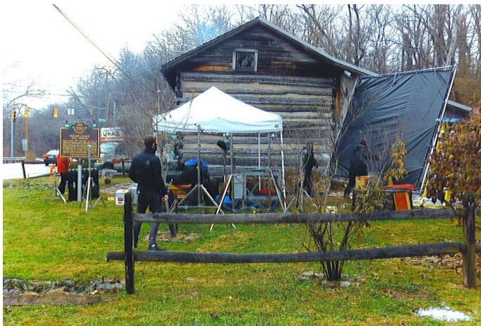
Action later moved to the side door of the Log House.

Members of ATHS were on site at all times to observe and protect our treasures. Thanks to these members who covered two or three hour shifts: