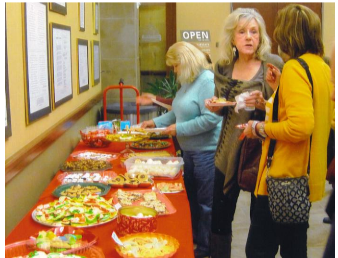
Holiday refreshments at the December 4, 2013 meeting.