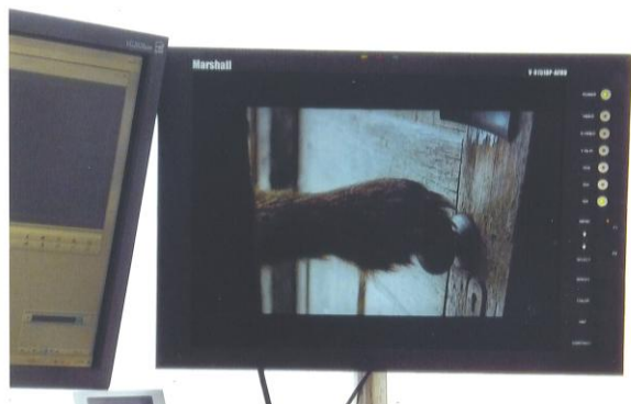
Image of "the Bear" opening the door as seen on the camera monitor.