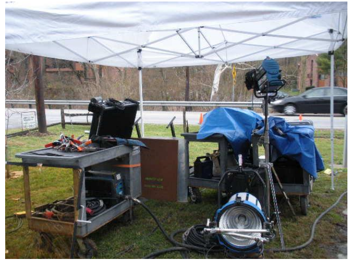
Some equipment on site.

The commercial was filmed on Thursday, Dec. 5 beginning at 5:00 a.m. and ending at 7:15 p.m. If you happened to drive by the Log House on that day you saw trucks, vans, SUVs, cars, seven tents, lights, screens, reflectors, and camera equipment all over the property.