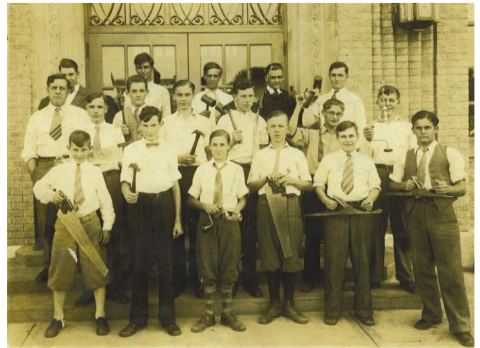
“Old Industrial Arts” at Anderson High School, 1931.