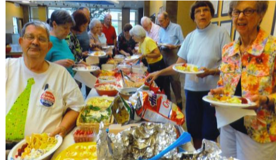
Picnic food and fun from August 2013.

Join us as we continue the long tradition of the summer picnic. We now enjoy the comforts and air-conditioning of Anderson Center for the event. Tables and chairs will be set up in the Lower Atrium. You can walk outside before dinner and listen to the sounds of the interpretive trail around the ponds if you like.