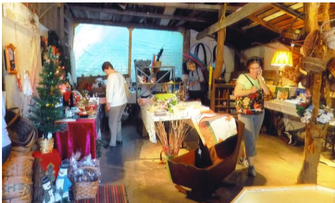
Cobweb Corner in the barn, Country Store 2013