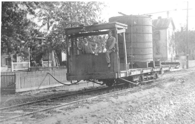
About 1910. Photo was taken along the IRT "Black Line" railroad tracks on Beechmont, at what is now the corner with Wolfangel.