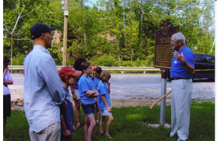
Photos of Mercer students at the Log House, May 27, 2014