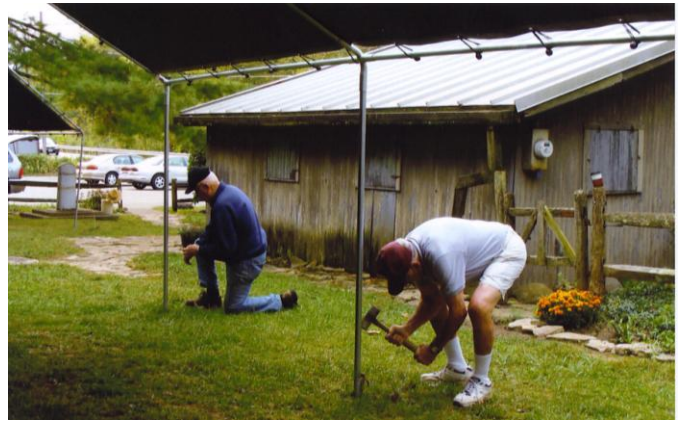
Putting up the tents in 2013 -- all part of setting up for the Country Store. Volunteers are needed for September 2014!

This year's raffle will feature two first prizes. Purchasers will select from either the traditional "Dinner for 8" in the Log House or a handcrafted quilt with pictures of 20 historic Anderson Township images. This quilt is nearly identical to last year's offering. If you tried to win one last year and missed, this is your opportunity to try again! Please purchase your tickets either at the Country Store, August 6 AHS Picnic, or at the AHS table at Anderson Days at Beech Acres. Second prizes in each of the raffle categories will also be presented.