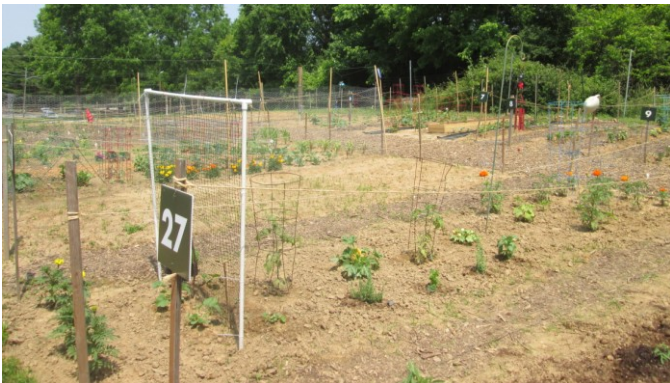
View to the northwest in the garden plot area on June 4, 2019.

The garden plots available for this year are all in use. It is a pleasure to see the many varieties of vegetables and flowers, to compare different planting techniques and to watch the plants thrive. The water system is working but up to now there has been an abundance of rain with a record rainfall of over 8 inches in June. Thanks to the tremendous efforts of many volunteers, the plot area is now surrounded by fencing to discourage our animal neighbors from browsing on the choice plants and harvesting the crops.