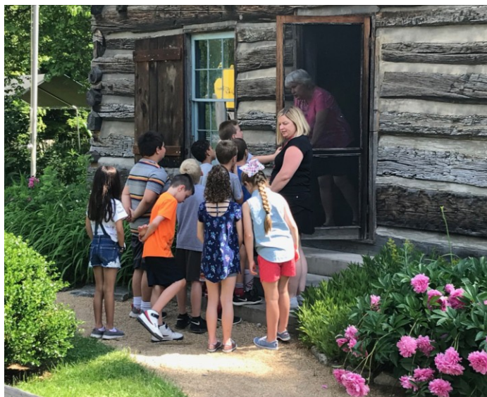
Visit of Mercer Third Graders to the Miller-Leuser Log House in May 2019.

An Open House is a perfect time for members of ATHS to refresh their memories of the Log House and to view new displays and recent renovations. Come see the new farm displays in the Clough Pike barn. Attend one of the Open House Sunday afternoons and be amazed!