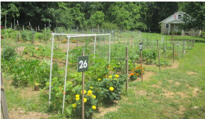
View to the northeast in the garden plot area about a month later on July 8, 2019.

The “ SEED BASH ” event held on Sunday, May 19 at the ATHS farm property, 2550 Bartels Road, was a great success -- even with rain showers! This Opening Day event was highlighted by Eli’s BBQ, refreshments, kids’ activities, and entertainment from the local bands: the Clough Valley Boys and Blu Million.