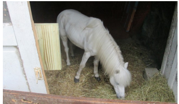
Below: Guest for the Seed Bash event enjoying the lower level of the historical barn.