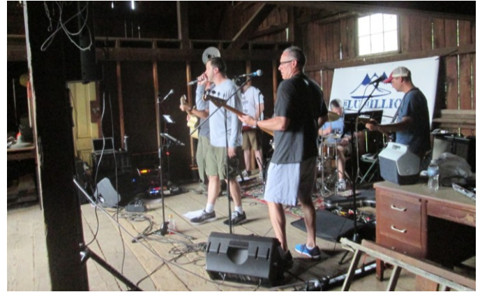
Above: Blu Million band playing in the Bartels Road barn during the Seed Bash on May 19, 2019.

Monthly meetings of the Urban Farm group are held on the third Thursday of the month at the Farm at 7:00 p.m.