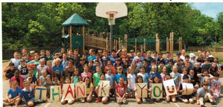
The Thank you Card from the 3 rd grade Mercer students who visited the Log House in May 2019 included this photograph of the group.