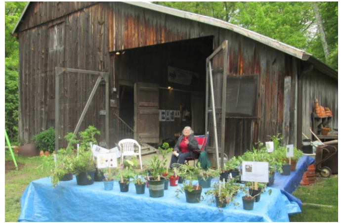
Some of the many displays of plants for sale at the May 11 Plant Sale.