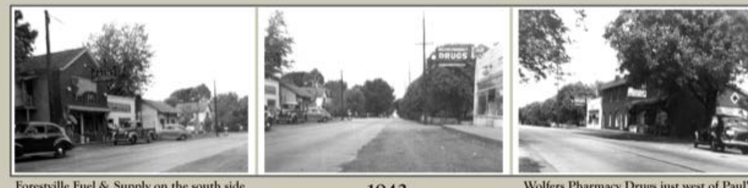
Forestville Fuel & Supply on the south side of Beechmont now FedEx Kinkos

The IR&T The Interurban Railroad & Terminal Co. 1902- 1922 ran along the Cincinnati and West Union Turnpike or Ohio Pike.