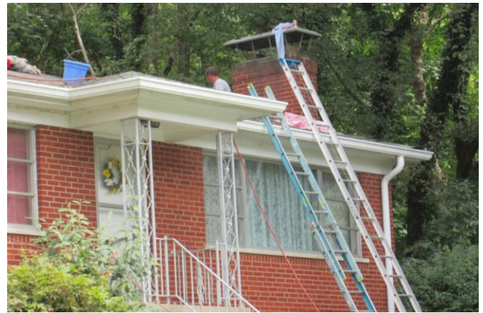
ATHS Brick House, August 25, 2015. Replacement of the roof and gutters by Campbell Roofing.