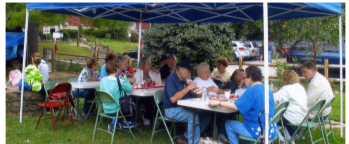
Lunch at the Country Store.