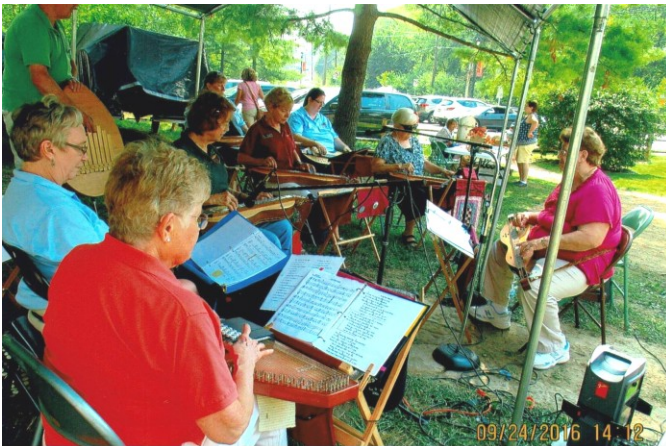
Dulcimer Society musicians provided entertainment at the Country Store on both Saturday and Sunday.