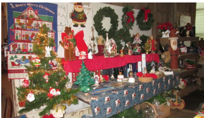
Holiday decorations for sale at Cobweb Corner.