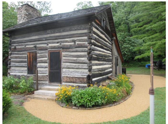
Log House and completed pathway, July 28, 2016.