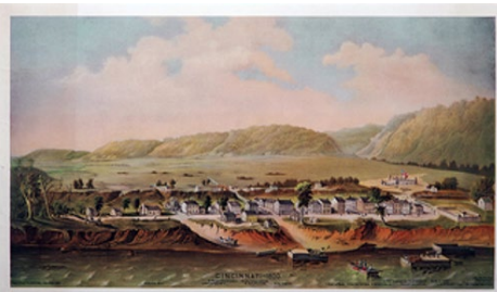
Cincinnati about 1800: population 750

Wednesday, October 5th at 7:30 p.m. Anderson Center at 7850 Five Mile Road