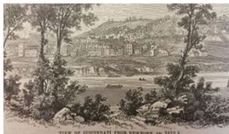
Cincinnati in 1812: population: 2,000

By 1850 Cincinnati was the sixth largest city in the U.S. - population: 115,435