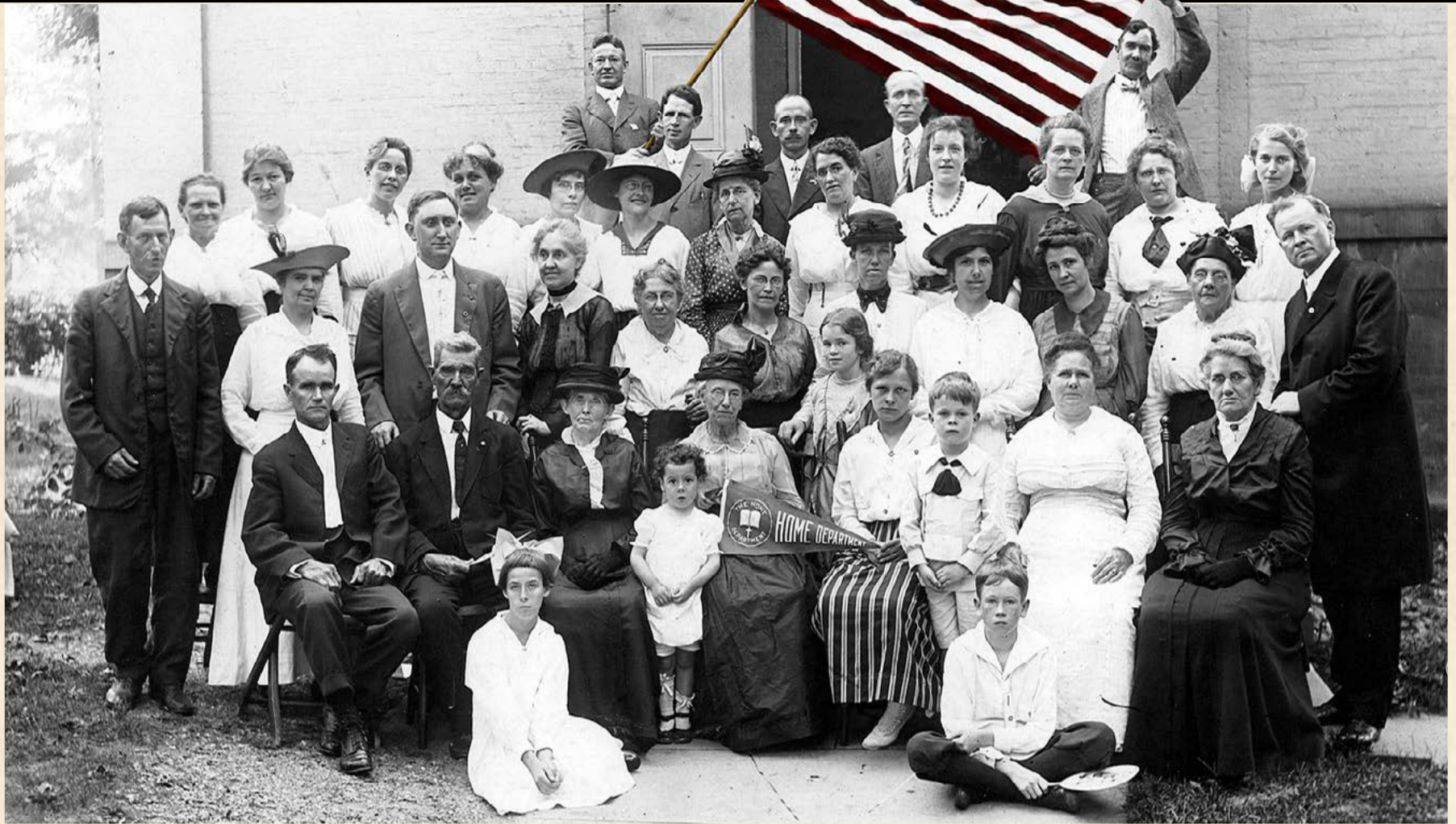
From the AHS Archives: "The Fourth of July" Celebrated by members of the Home Department of the Mt. Washington ME Church. Photo Tinting and restoration: Lesley Gressle https://www.facebook.com/ATHSOHio